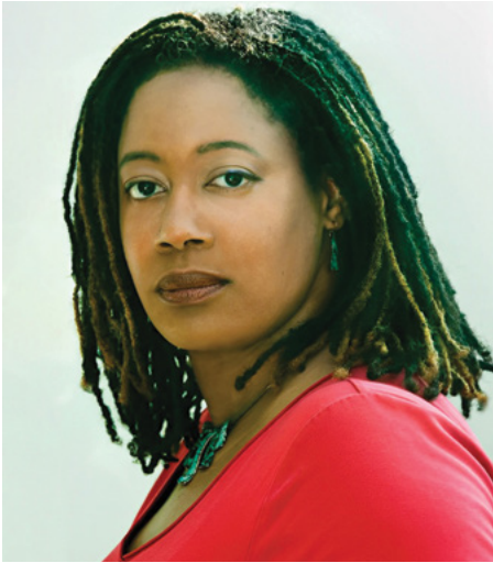
N.K. Jemisin author